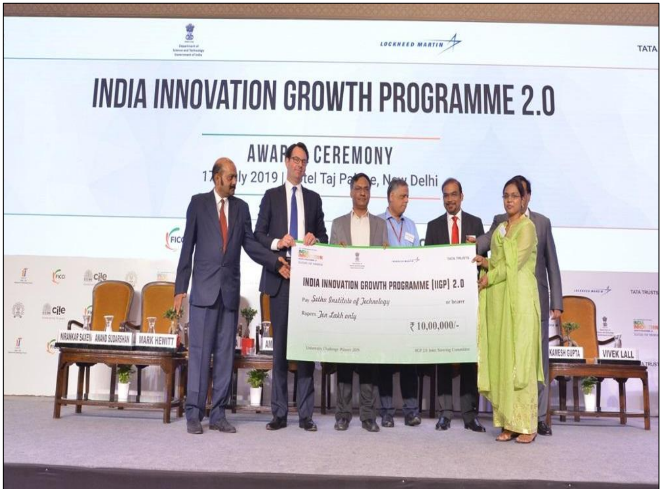
DST-LOCKHEED & IIGP 2.0 AWARD 2019