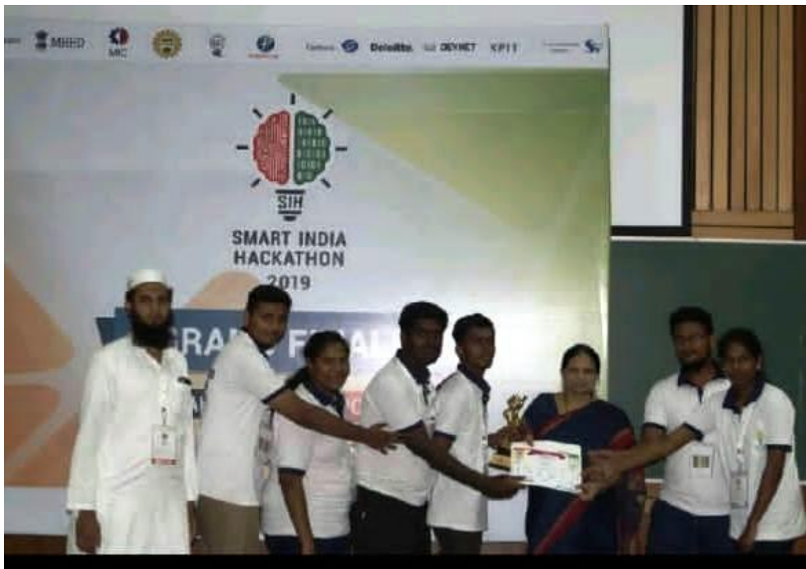
Smart India Hackathon 2019 Award – Winner