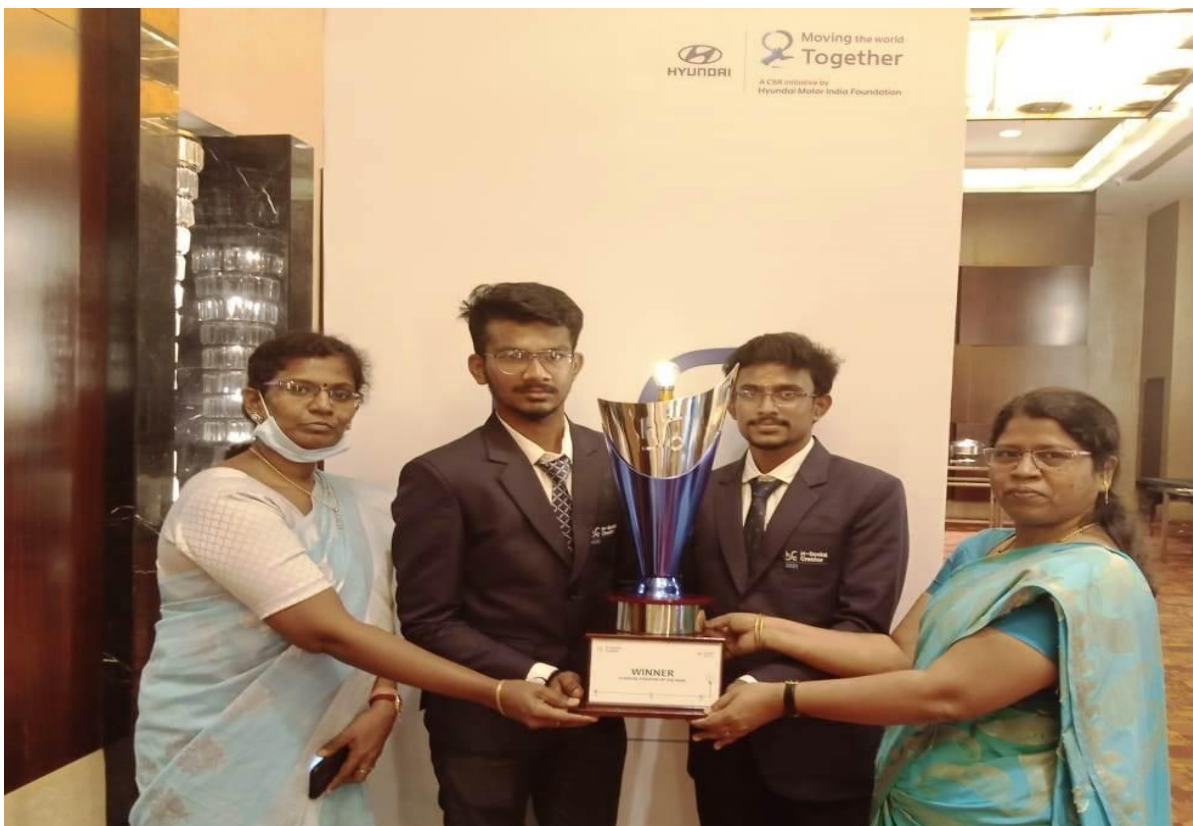
H-Social Creator 2021– Innovator Award Winner